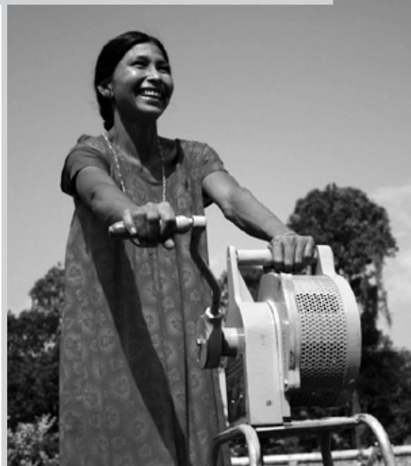
Test the siren of Meghauri's early warning system, Nepal